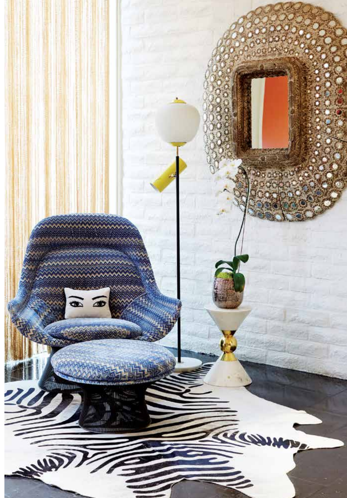
The newly revamped Parker hotel in Palm Springs, with its mid-century entrance (top), staircase with carpeting inspired by the halls of the fictional Overlook Hotel in The Shining (bottom), and lobby with bold and cheeky decor (opposite page).